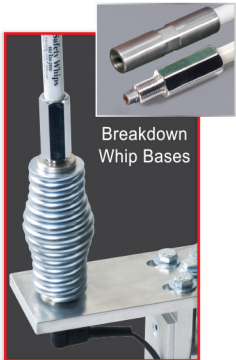
Breakdown Whip Bases