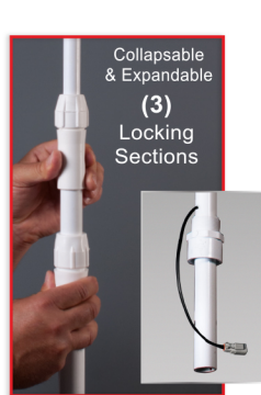
Collapsible & Expandable (3) Locking Sections