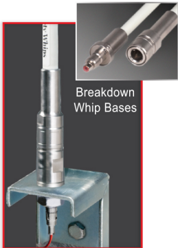
Breakdown Whip Bases