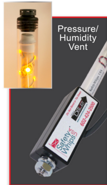
Pressure/ Humidity Vent