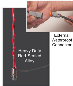
External Waterproof Connector