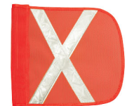
FLAG11-O-XW Orange with White Reflective "X" 11.5"L x 11.5"H