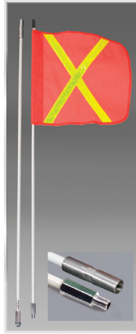
W08BDSTNP-XY Heavy Duty Breakdown Whip 8ft (2.44m), Non-Powered 16" orange mesh flag with yellow reflective "X"