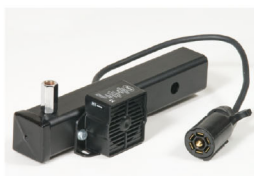
HM1NPA Hitch Mount with Non-Powered Threaded Mount and 107 dB Backup Alarm