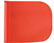
FLAG11-O Orange 11.5"L x 11.5"H

Mesh Flags, Fluorescent Safety Colors, UV Resistant, Anti-Microbial & Fray Resistant