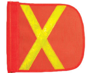
FLAG11-O-XY Orange with Yellow Reflective "X" 11.5"L x 11.5"H