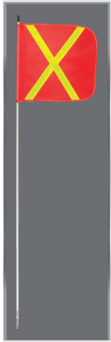
W05NP-XY 5ft (1.52m), Non-Powered 16" orange mesh flag with yellow reflective "X"

High quality fiberglass whips providing over 1000ft (304.8m) of visibility maximizing vehicle recognition in all types of environmental conditions. These Heavy Duty, All Weather safety whips are perfect for all Heavy Duty Equipment and built to handle harsh and extreme environments with it's tough, rugged structure for added stability and durability. Available in both powered and non-powered and constructed with safe & non-conductive fiberglass with standard whip lengths from 5ft (1.52m) up to 12ft (3.66m). Customizable lengths are also available upon request!