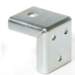
ABM Heavy Duty Bracket - Attach whips to toolbox, rack, or truckbed