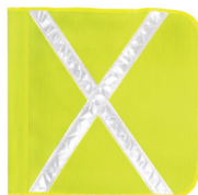
FLAG16-Y-XW Yellow with White Reflective "X" 16"L x 16"H