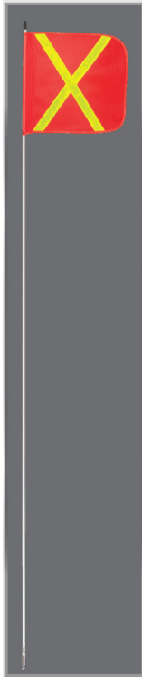
W08NP-XY 8ft (2.44m), Non-Powered 16" orange mesh flag with yellow reflective "X"