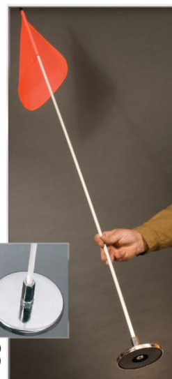
LWM-BH-100 (4.90" diameter)

LWW05-M 5ft (1.52m), 5/16" rod Light Duty Whip with Window Mount 11.5" orange mesh flag