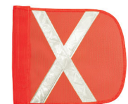
FLAG11-O-XW Orange with White Reflective "X" 11.5"L x 11.5"H