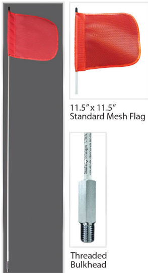
11.5" x 11.5" Standard Mesh Flag

Super affordable and lightweight warning whips for all Light Duty vehicle & equipment needs. Every whip is constructed with safe & non-conductive Fiberglass with standard whip lengths from 2ft (.61m) up to 7ft (2.13m). Customizable lengths are also available upon request. Complete your whip solutions with our various assortment of safety flag and mounting options for all equipment and vehicle needs!