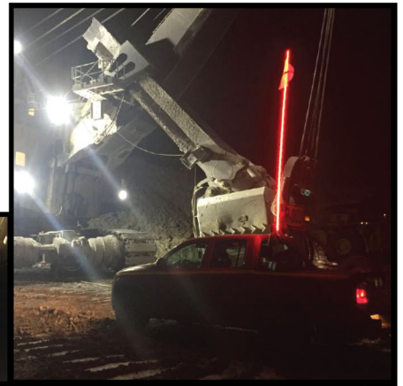
SDL10R-XY (Super Duty LED Whip) shown on truck