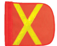
FLAG11-O-XY Orange with Yellow Reflective "X" 11.5"L x 11.5"H