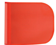
FLAG11-O Orange 11.5"L x 11.5"H

Mesh Flags, Fluorescent Safety Colors, UV Resistant, Anti-Microbial & Fray Resistant