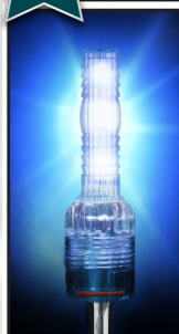
SC4-CB Blue LEDs