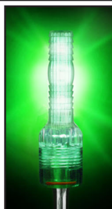
SC4-CG Green LEDs