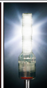
SC4-CW White LEDs