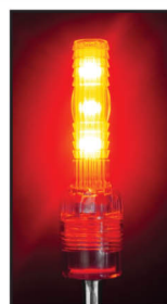
SC4-CR Red LEDs