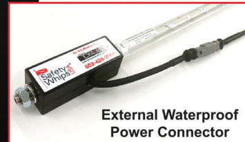
External Waterproof Power Connector

NEW Super Duty LED Whip TOUGHEST LED WHIP BUILT!