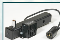
HM1NPA :Hitch Mount with Non-Powered Threaded Mount and 107 dB Backup Alarm Non-Powered