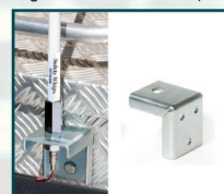
ABM: Angle Bracket Mount Attach whips to toolbox, rack or truck bed with this heavy duty bracket.