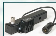
HMQDNPA : Hitch Mount with Non-Powered Quick-Connect Mount and 107 dB Backup Alarm Non-Powered