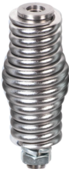
519.30BNP Shown Above