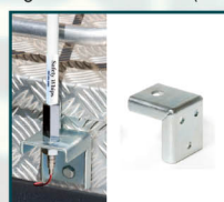
ABM: Angle Bracket Mount Attach whips to toolbox, rack or truck bed with this heavy duty bracket.