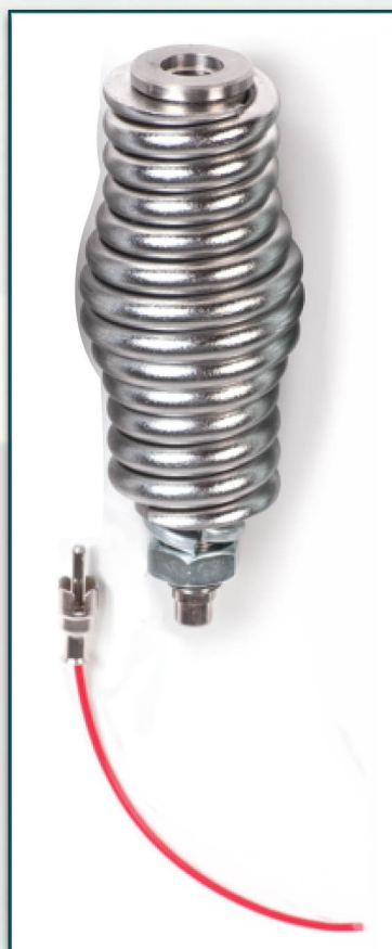
519.30B Shown Above