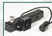
HMQDA : Hitch Mount with Quick-Connect Mount and 107 dB Backup Alarm