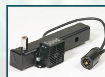
HM1A : Hitch Mount with Standard Threaded Mount and 107 dB Backup Alarm