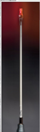
SD05-30B-2CR - 5' (1.52m)