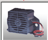
HM-B/U-alarm 107db Backup Alarm designed for 107 decibels, current draw of 0.5 Amps.