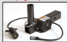
HMTDA 7-Way power plug, External Waterproof Connector and Back-up Alarm

*Available for Threaded & Quick Disconnect Whips