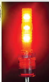
SC4-CR RED LEDs, Constant mode Multi-Voltage 10-40V (shown to the right)