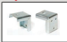
ABM Zinc Plated Mount - attach whips to toolbox, rack or truck bed