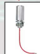
519.343 Threaded Mount for Powered Threaded Whips