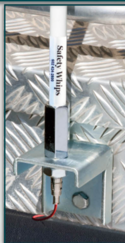
Shown with Heavy Duty Steel Thread Mount (519.343.RCA - Powered)