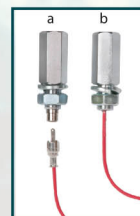
a : 519.343.RCA b : 519.343 (Powered)