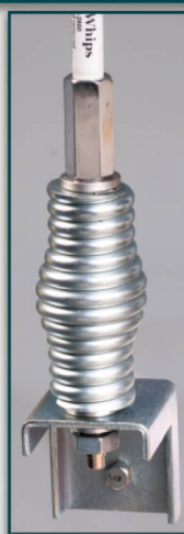
Shown with Heavy Duty Spring Mount (519.30B - Non-powered)