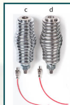
c : 519.309 Stainless Steel d : 519.30B Zinc Plated Steel (Powered)

Heavy Duty Spring Mounts (Quick Disconnect, Threaded Whips)