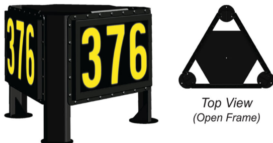
Top View (Open Frame)

12"H, Super Duty LED Reflective Backlit Display shown with Fluorescent Amber (A) Characters