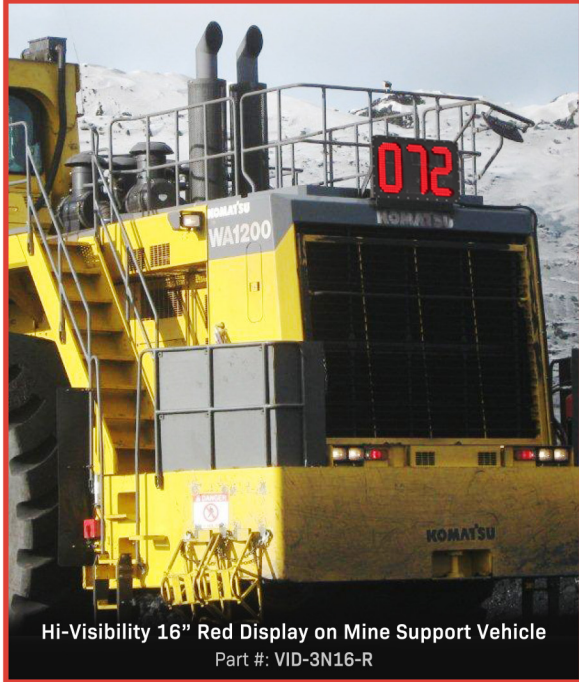
Hi-Visibility 16" Red Display on Mine Support Vehicle Part #: VID-3N16-R